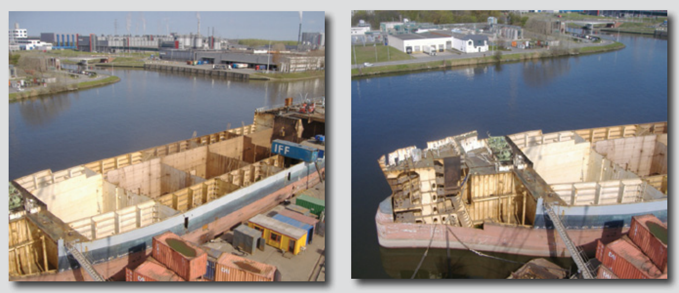
showing the stages of pre-cutting, ready for the hull to be towed up the slipway