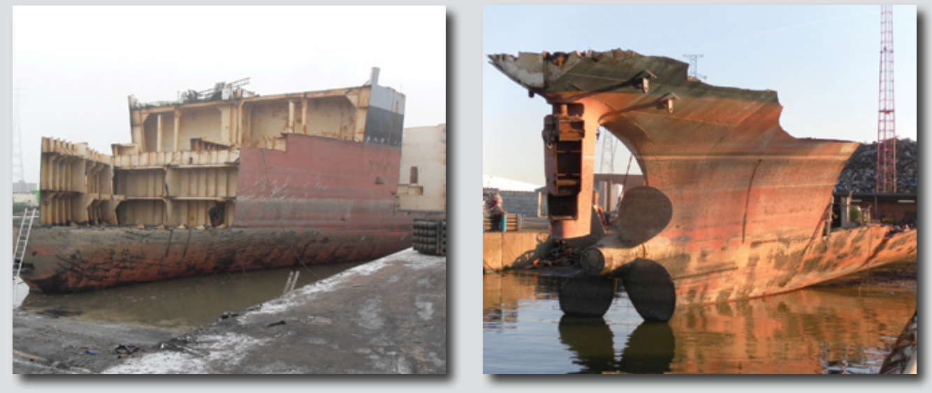
Remains of the engine room