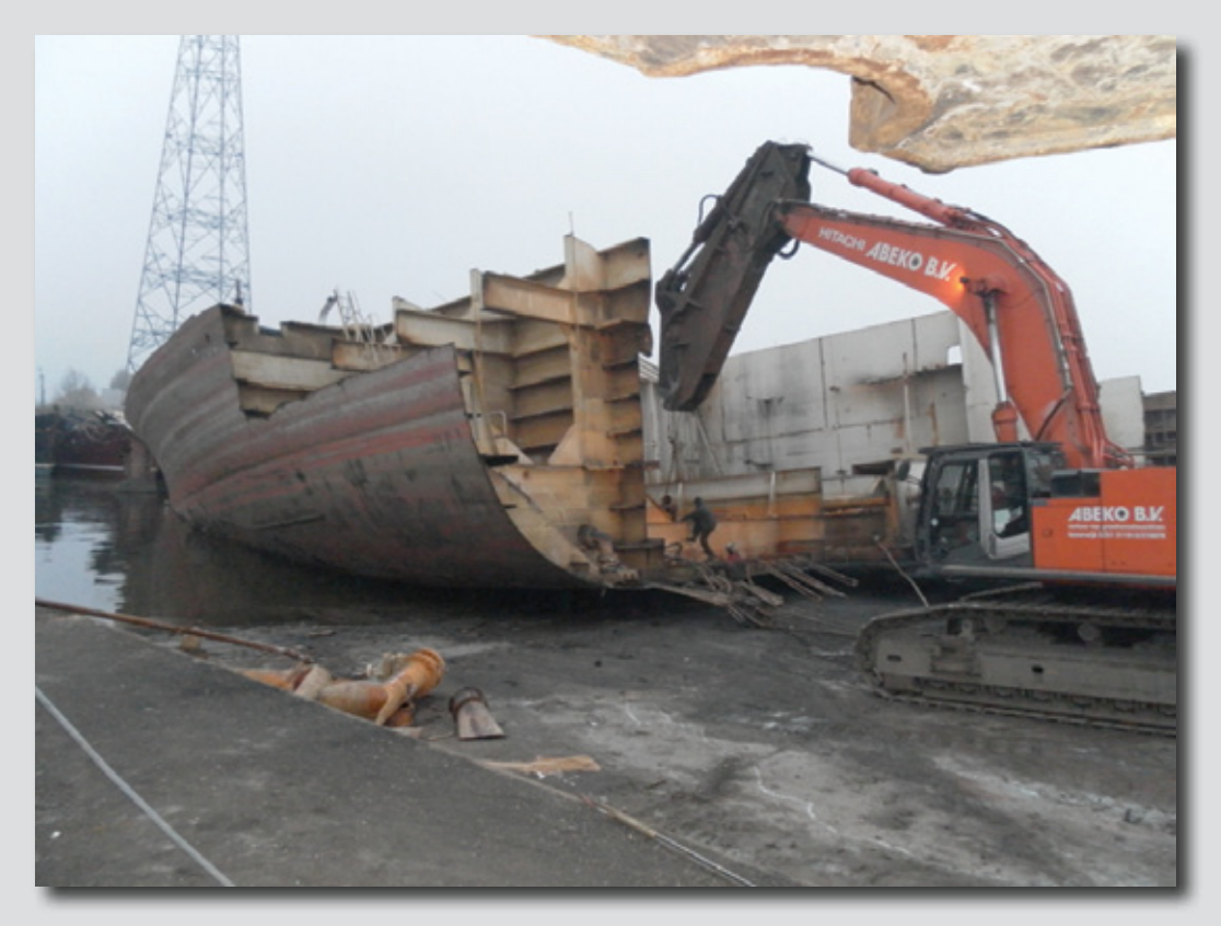
Final stages of dismantling with just the engine room left

Recycling, all of which have complied with all international agreements and principles concerning environmentally sound management of waste. Van Heyghen Recycling successfully dismantled ex-HMS Fearless in 2009 and Ex-Auxiliary Support Vessel Rame Head in 2010.