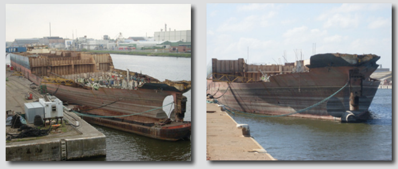
Brambleleaf on the quayside awaiting the opening of the slipway to start her final voyage