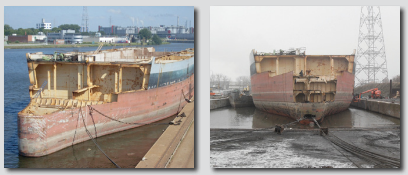
Brambleleaf on the Slipway